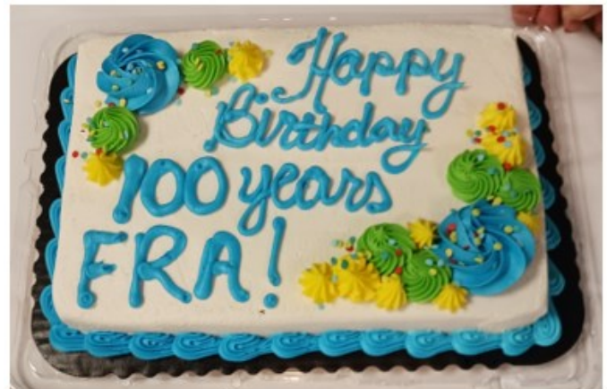
During the Veterans Day Indoor Picnic, there was a cake honoring the 100 th Birthday of the Fleet Reserve Association.